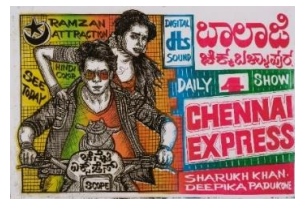
Image: Film poster: Chennai Express , 2013, ink on paper, hand-drawn and printed, 20 x 30 in. Museum purchase.

The Indian film industry, or Bollywood, is the world's largest producer of films, releasing more than one thousand a year. These films are a spectacular blend of romance, melodrama, fantasy, song, and dance extravaganza. This exhibition explores the history of Bollywood posters and their influence on popular culture, religion, and art. Showcased alongside the film posters are prints, calendars, images of temples dedicated to Bollywood film stars, as well as wedding posters, and other appropriations both personal and commercial. Along with the exhibition, a Bollywood film screening, and a symposium will also be held.